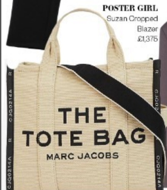
MARC JACOBS Medium Tote Cotton-Canvas Bag £350