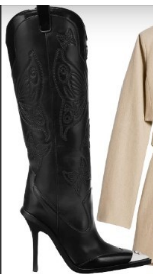
VERSACE Butterflies Knee High Boots £1,840