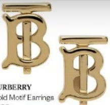
BURBERRY Gold Motif Earrings £220