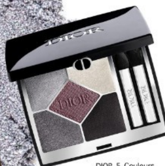
DIOR 5 Couleurs Eyeshadow Palette £55