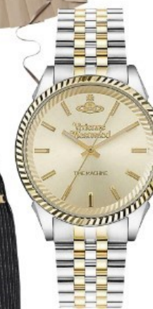
VIVIENNE WESTWOOD Stainless Steel Quartz Watch £285