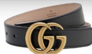
GUCCI Logo Embellished Leather Belt £380