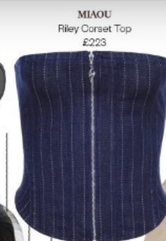
MIAOU Riley Corset Top £223