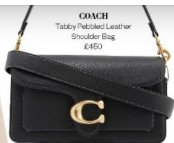
COACH Tabby Pebbled Leather Shoulder Bag £450