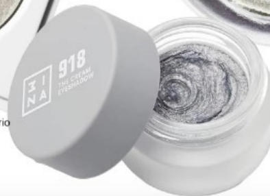
3INA The Cream Eyeshadow 918 £15