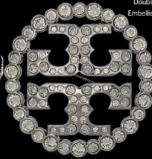
Tory Burch Double T Crystal Embellished Brooch £145