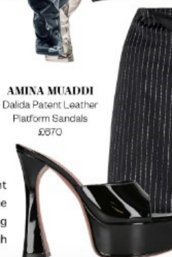
AMINA MUADDI Dalida Patent Leather Platform Sandals £670