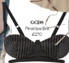
GCDS Pinstripe £270