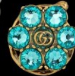
GUCCI Double G Crystal Flower Hair Clips £575