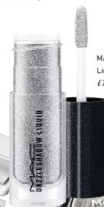
MAC Dazzleshadow Liquid Eyeshadow £20