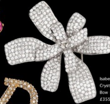
Isabel Marant Crystal Embellished Bow Detail Brooch £355