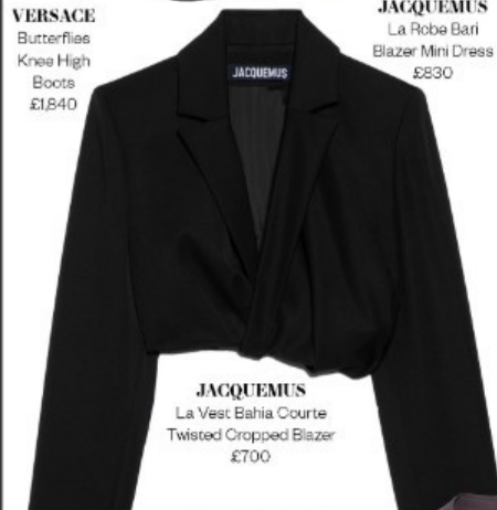
JACQUEMUS La Vest Bahia Courte Twisted Cropped Blazer £700