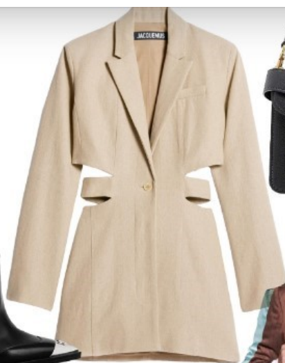
JACQUEMUS La Robe Bari Blazer Mini Dress £830