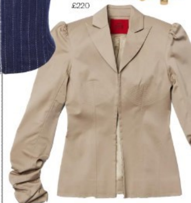
DILARA FINDIKOGLU Girls Dont Cry Jacket £1,352