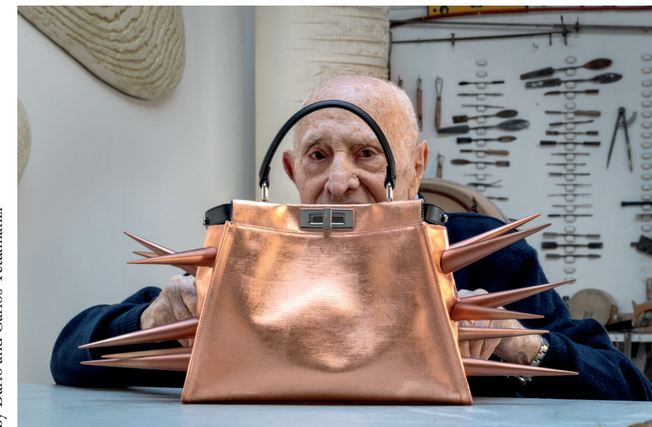
Arnaldo Pomodoro, Portrait with Peekaboo

He received the Sculpture Prizes at the Biennials of São Paulo (1963) and Venice