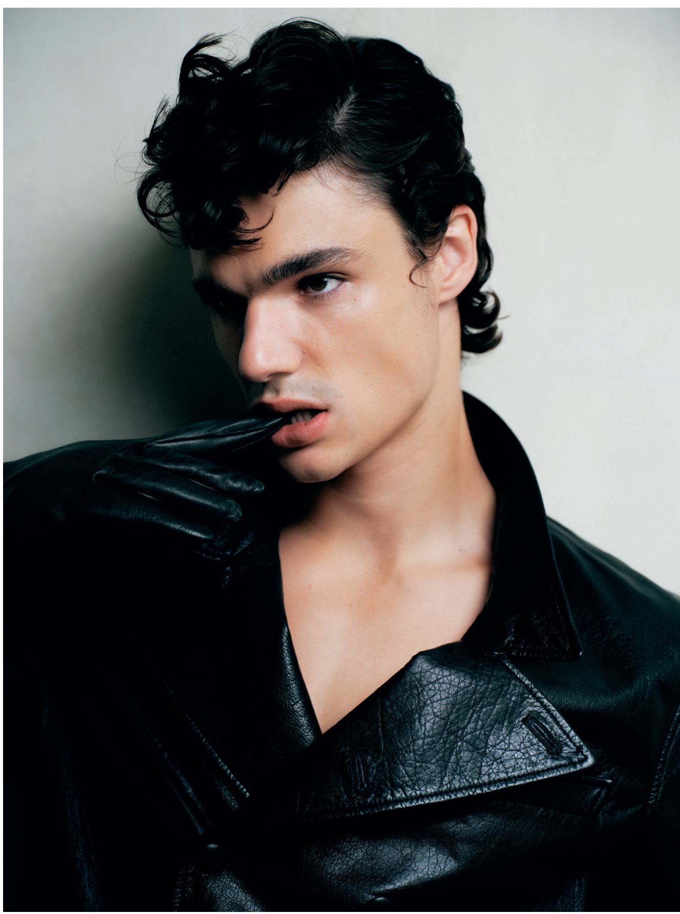
Blouson in black nappa leather with stand-up collar and asymmetrical button closure and leather gloves EMPORIO ARMANI