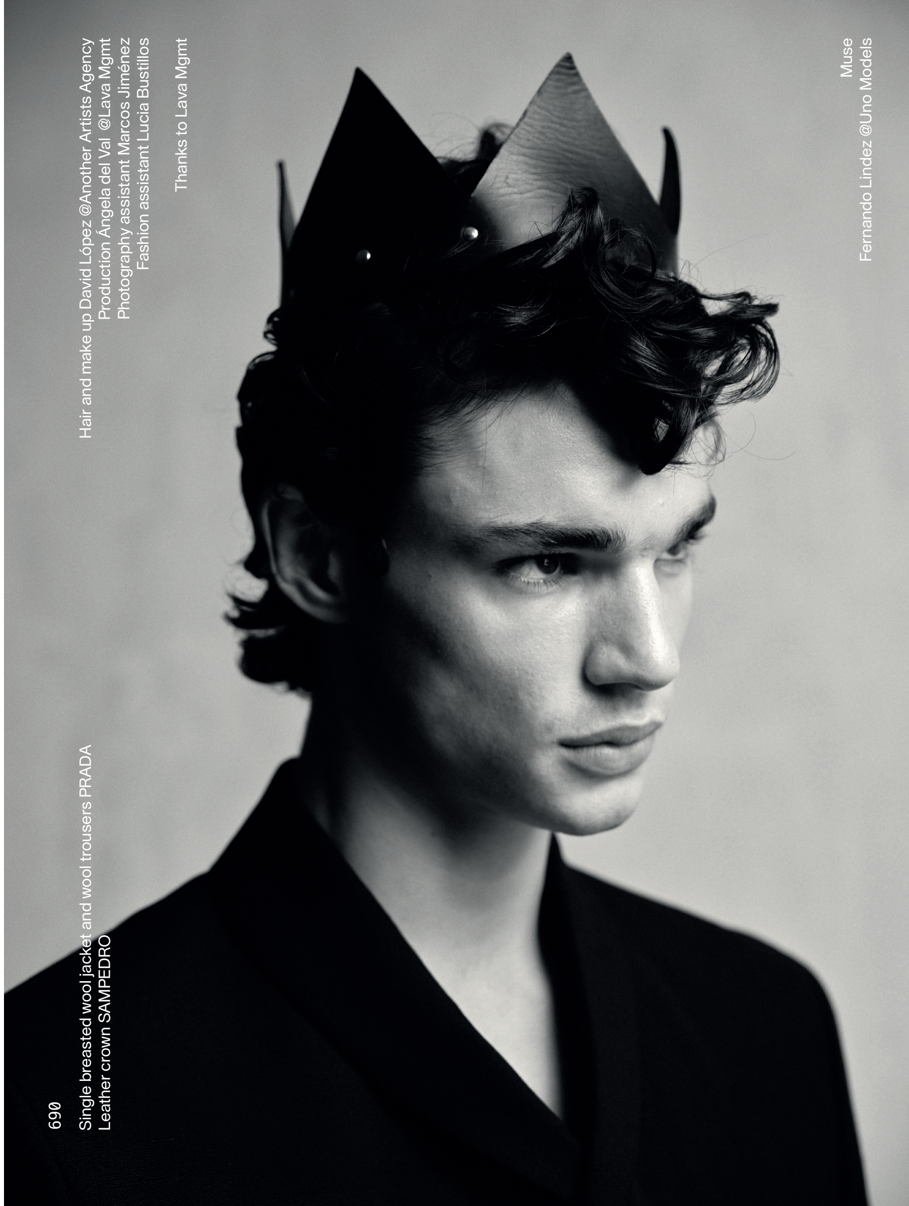
Single breasted wool jacket and wool trousers PRADA Leather crown SAMPEDRO