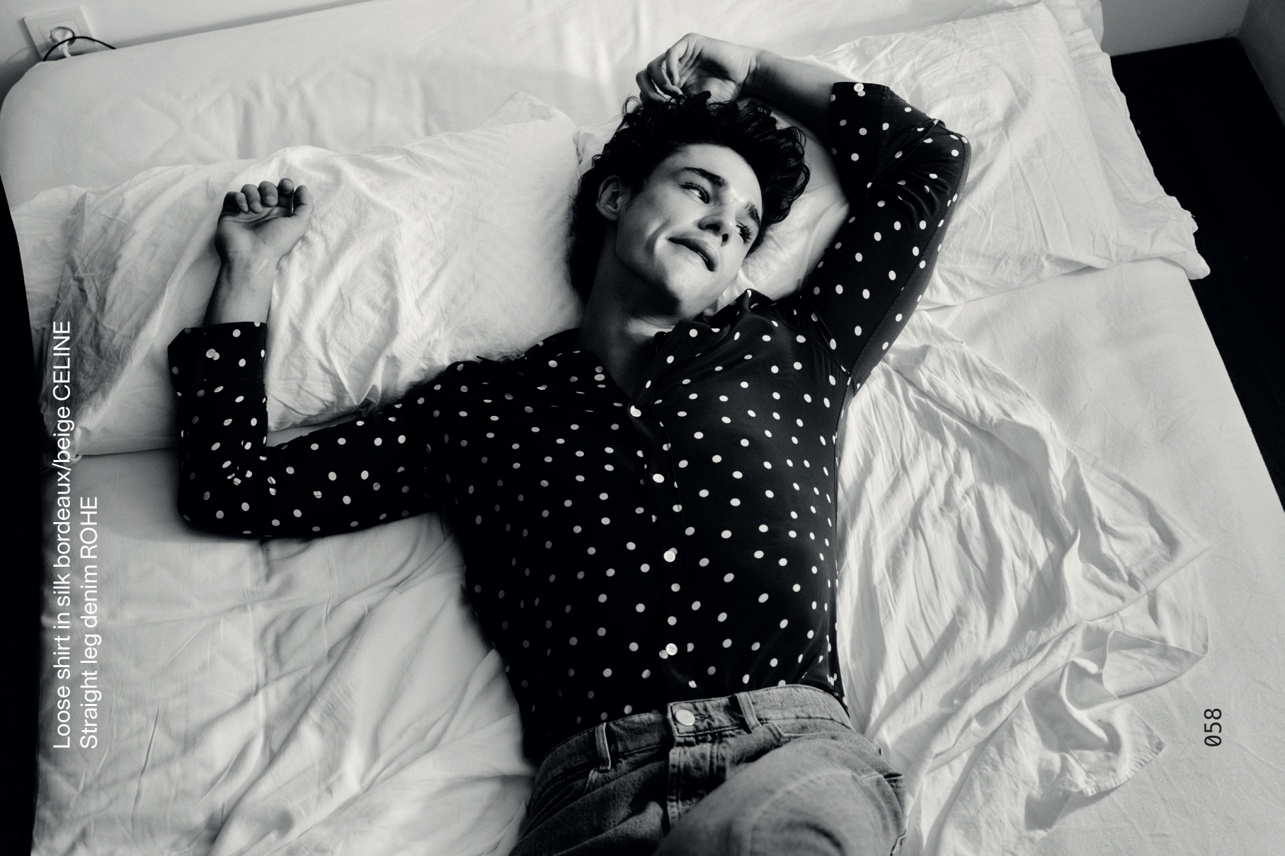
Loose shirt in silk bordeaux/beige CELINE Straight leg denim ROHE