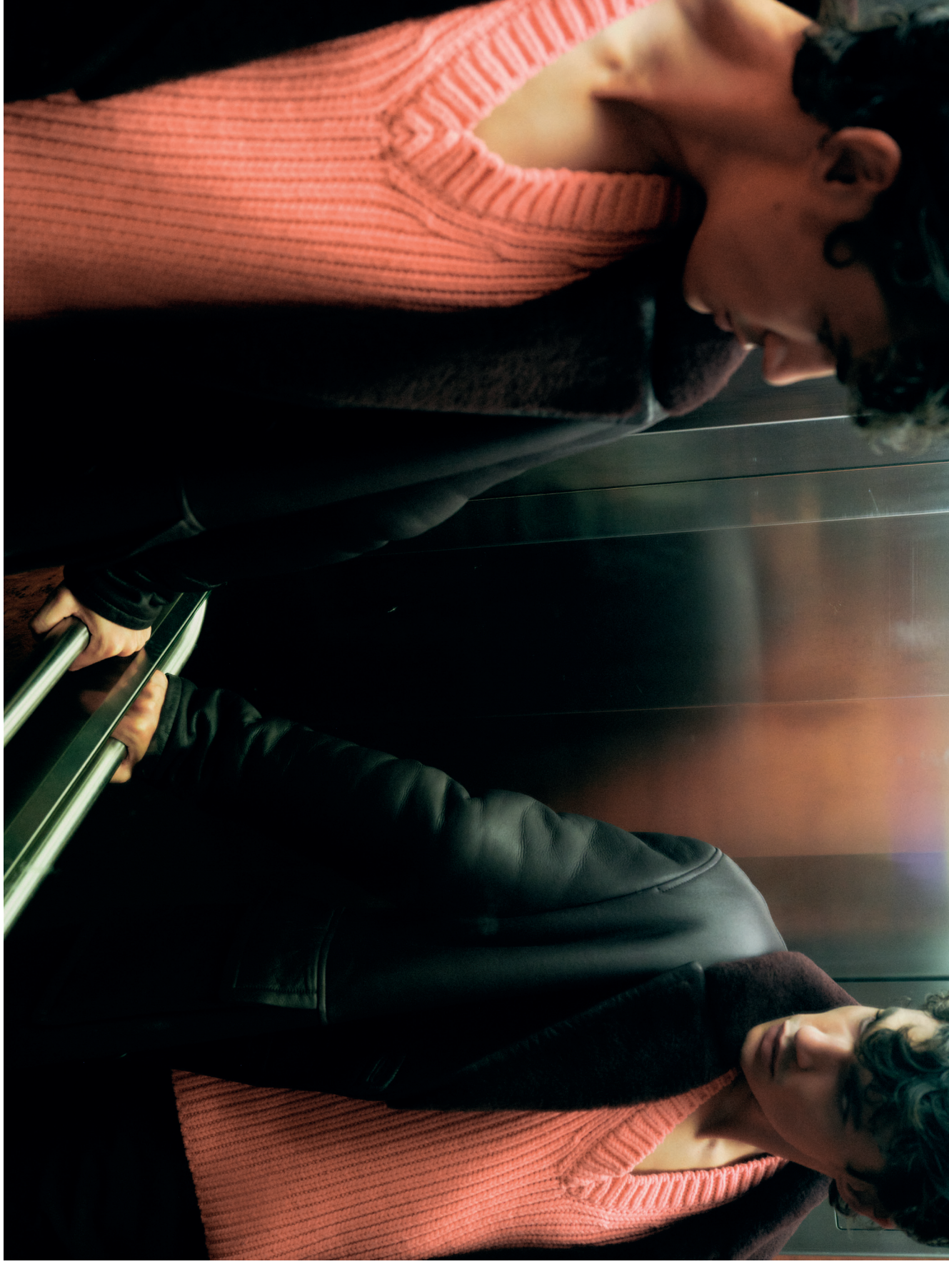
Shearling coat, pink wool jumper and long wool trousers LANVIN